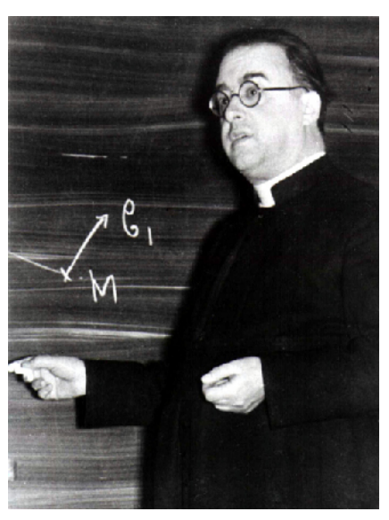
Figure 29.11 Abbé Georges Lemaître (1894–1966). This Belgian cosmologist studied theology at Mechelen and mathematics and physics at the University of Leuven. It was there that he began to explore the expansion of the universe and postulated its explosive beginning. He actually predicted Hubble's law 2 years before its verification, and he was the first to consider seriously the physical processes by which the universe began.

It is one thing to say the universe had a beginning (as the equations of general relativity imply) and quite another to describe that beginning. The Belgian priest and cosmologist Georges Lemaître was probably the first to propose a specific model for the Big Bang itself ( Figure 29.11 ). He envisioned all the matter of the universe starting in one great bulk he called the primeval atom , which then broke into tremendous numbers of pieces. Each of these pieces continued to fragment further until they became the present atoms of the universe, created in a vast nuclear fission. In a popular account of his theory, Lemaître wrote, "The evolution of the world could be compared to a display of fireworks just ended—some few red wisps, ashes, and smoke. Standing on a well-cooled cinder, we see the slow fading of the suns and we try to recall the vanished brilliance of the origin of the worlds."